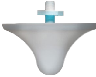
Omni Antenna (indoor)