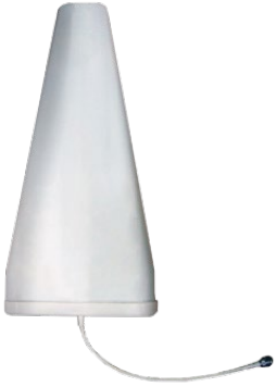
Log-periodic Antenna (outdoor)